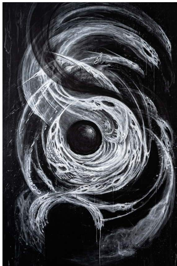
Catharses, Catharses 36 72"x48" Acrylic on Wood ©Catharses