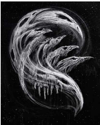
Catharses, Catharses 37 20"x16" Acrylic on Wood ©Catharses

Mystically entrancing and undoubtedly ambitious in glorious monochrome, Catharses' pieces in ENANTIODROMIA whirl together in overlapping secrets and continuous tales of suppressed emotions. In the artist's piece titled Catharses 33 , a powerful scene depicts a maelstrom engulfing creatures, branches, glass, and doomed souls, with a hovering triangle symbolizing manifestations and revelations. Much like the essence and core themes of the exhibit, the painting, Catharses 25 , perfectly encapsulates the idea of bringing light to emotions and burning away the built up negative energy in a ritual of release. In pieces like Catharses 8 , Catharses 21 , and Catharses 26 , the swirling brushstrokes create moments of movement, propelling the ideal that the energies these paintings exude live in an alternate reality where emotions manifest into an unconscious form. As the title suggests, ENANTIODROMIA addresses the state of the unconscious mind where suppression transforms into freedom and the darkness finds equilibrium with the light.