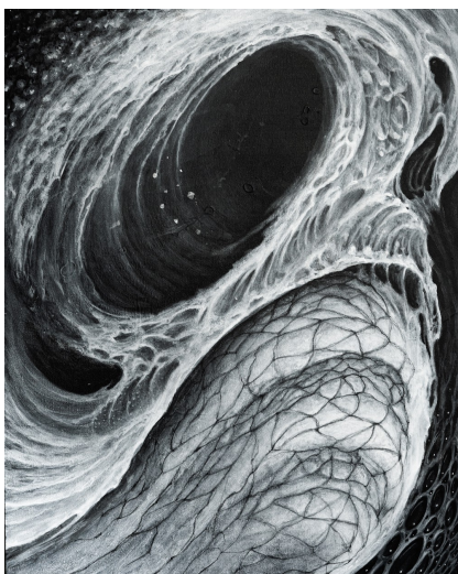
Catharses, Catharses 22 20"x16" Acrylic on Wood ©Catharses